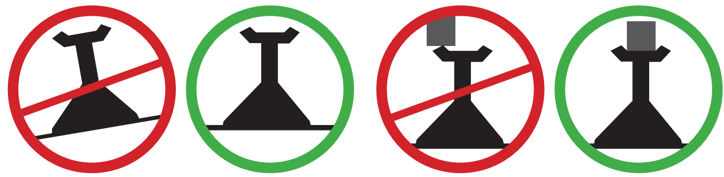
Safety stands should only be used on a hard flat surface