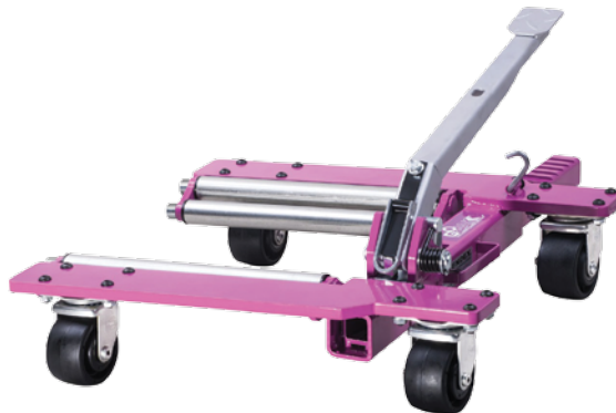
Model # GOJ-7016 For tires to up to 16" Wide 1,750 lbs per unit (Up to 7000 lbs capacity with 4 units) For SUV & Light Duty Trucks