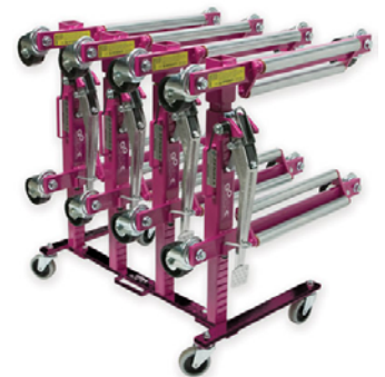
Also Available Model # GOJ-0400 Gojak Storage Rack

103 Milvan Drive, Toronto, Ontario, Canada, M9L 1Z7