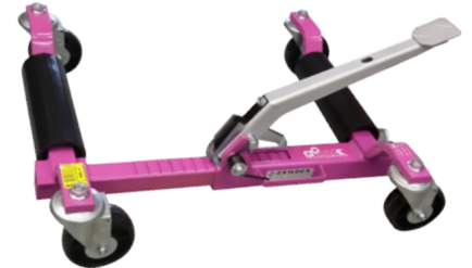
Model # GOJ-5211L/R For tires to 9"/ 11" Wide 1,300 lbs capacity per unit (Up to 5,200 lbs capacity with 4 units)