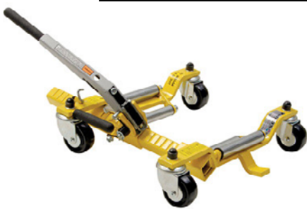
Model # GOJ-4100L/R For tires to 7" Wide 1,025 lbs capacity per unit (Up to 4,100 lbs capacity with 4 units)

All models are priced and sold by the unit