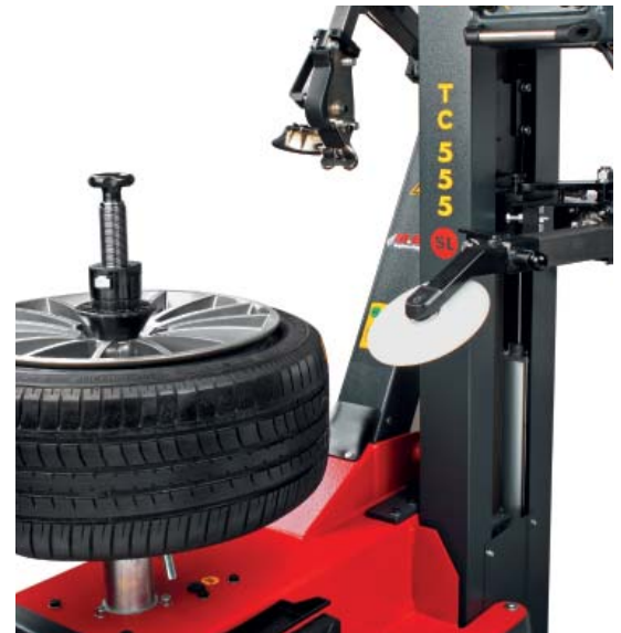
Combination breaker: adjustable blade for standard steel rim wheels and Adjustable Roller disc for high end and alloy wheels