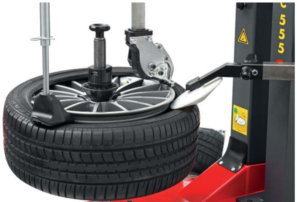
Centre Post clamping and leverless demounting tool (M&B patented)