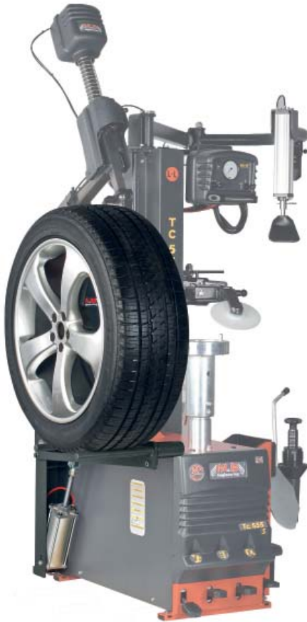
Wheel lift included