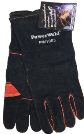
MODEL # WG-PW1003