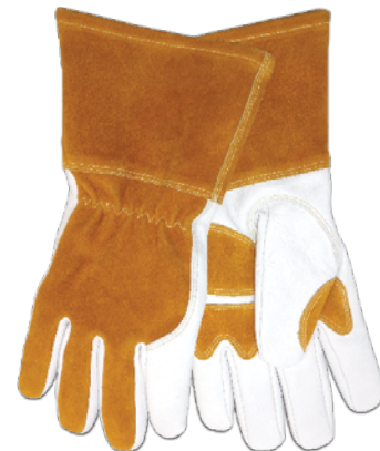
MODEL # WG-PW4000L