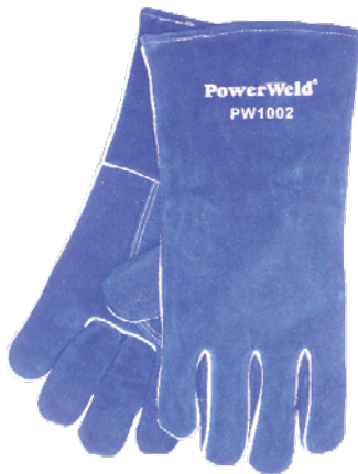
MODEL # WG-PW1002