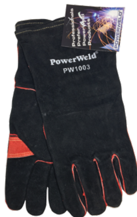
MODEL # WG-PW1003