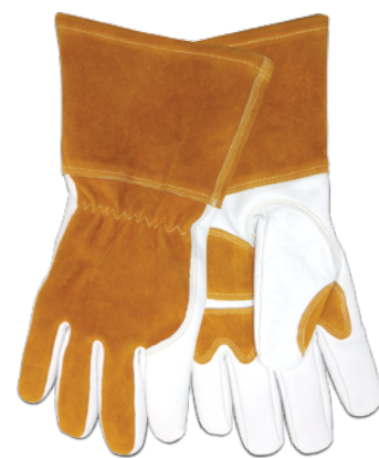
MODEL # WG-PW4000L