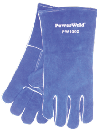
MODEL # WG-PW1002

Magnifying Lens MODEL # LM-175 • 2" x 4 1/4" • Diopter 1.75 Mag-175 • Other magnifications available