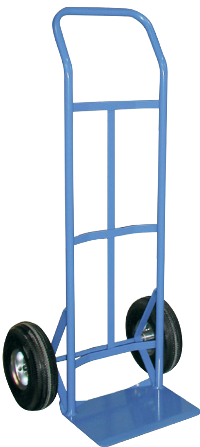
Model # HC-4 10" Pneumatic Wheels with Tubes