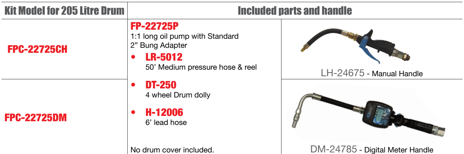
Kit shown, Model # FPC-22725DM

103 Milvan Drive, Toronto, Ontario, Canada, M9L 1Z7