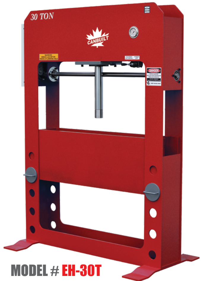
MODEL # EH-30T

ELECTRIC / HYDRAULIC SPECS: Standard Voltages Available: Please specify when ordering