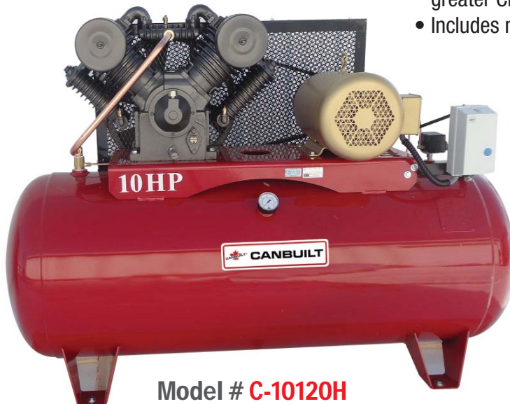
Model # C-10120H