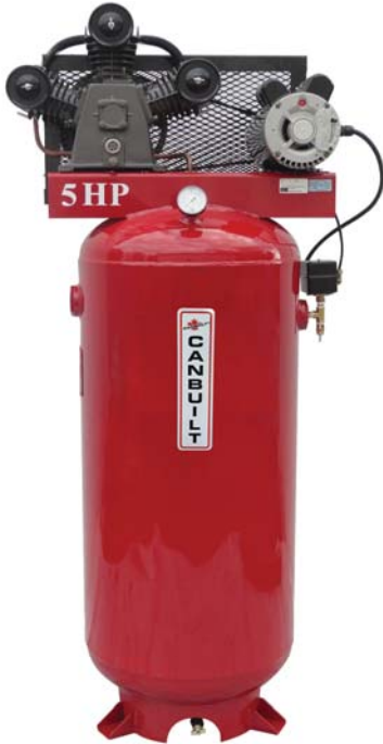
Model # C-560V