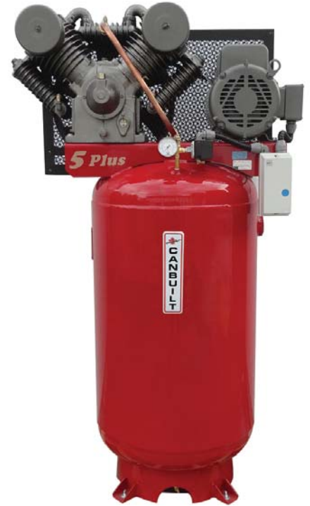
Model # C-HP580V