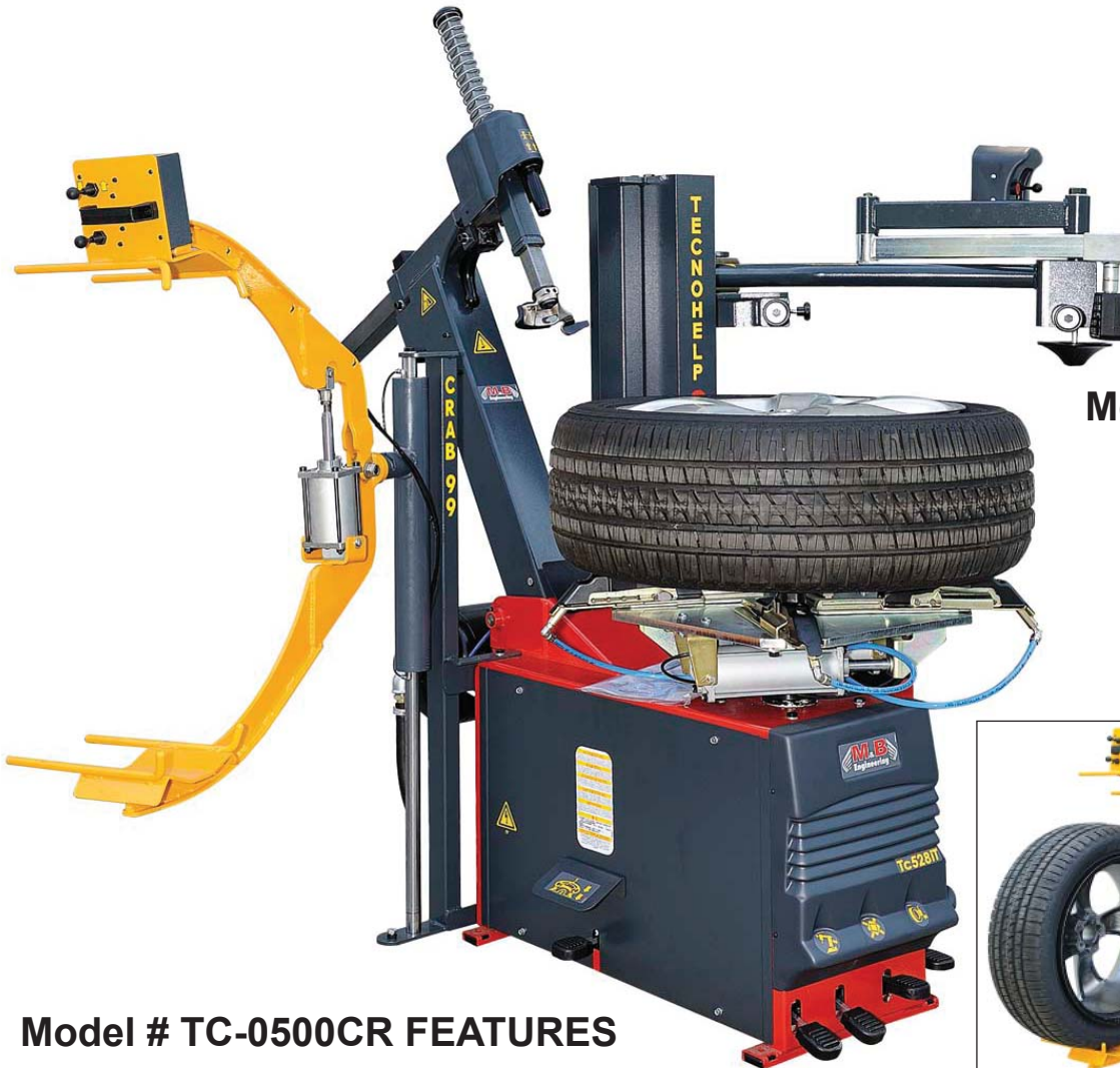
Model # TC-0500CR