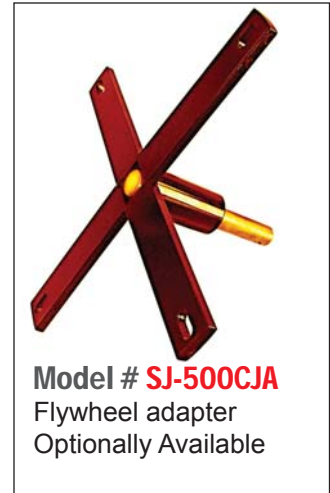
Model # SJ-500CJA Flywheel adapter Optionally Available