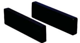
Parallel Bar Set Model # PB-1