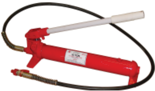
Manual Pump Model # BSP-1650