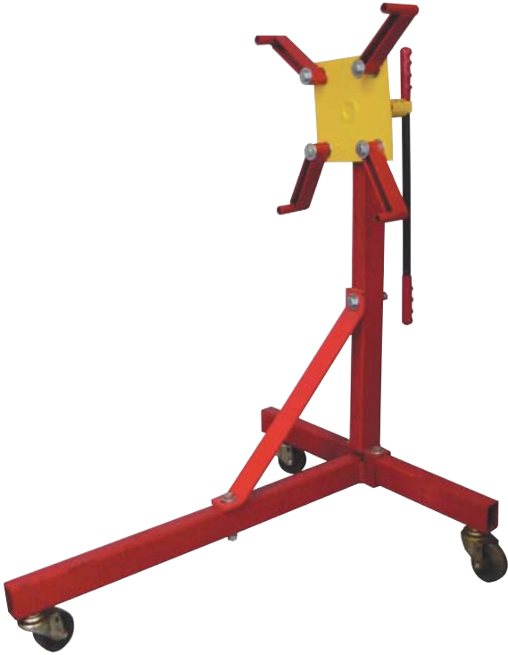
Model # 1250