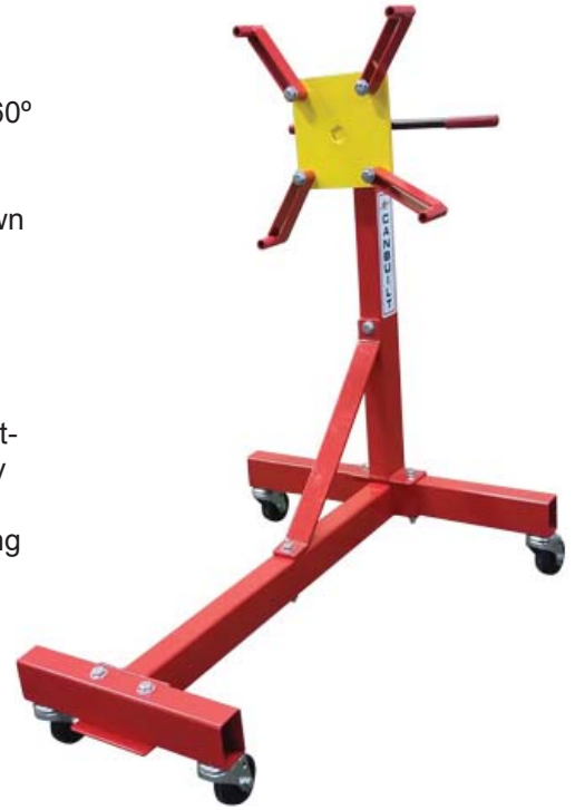
MODEL # 1500